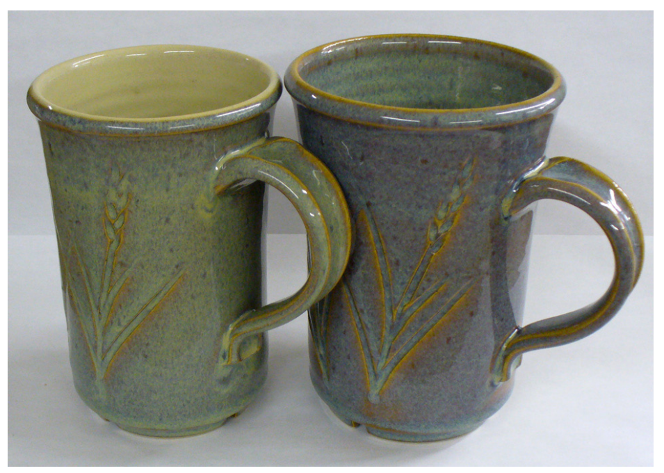
Adding 20% Ferro Frit 3134 to Alberta Slip produces a base that melts very well at cone 6. GA6-C (left) and GA6-E (right) simply add 4% rutile to get a stunning blue (E adds an additional 4% spodumene).